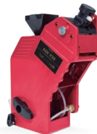
AZK V30 Espresso Group 7-14 g