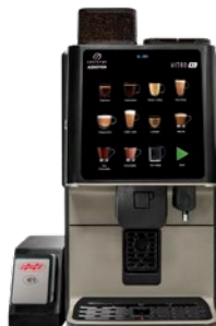
MDB Cashless module kit Ready to install a cashless payment system