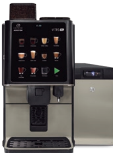
Smart Fridge Temperature sensor Milk level sensor

Vitro X1 MIA incorporates a 700-cc boiler becoming the perfect solution for Coffee-to-Go establishments, convenience stores, hotel and service stations where service needs to be intuitive and fast. It is also the perfect solution to promote a cooperative culture in the office, offering high quality fresh milk-based coffee beverages and a premium user experience.